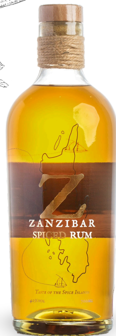
Zanzibar Spiced Rum