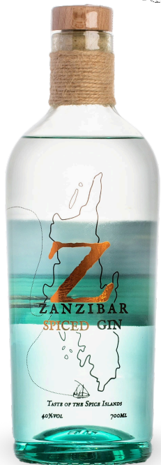
Zanzibar Spiced Gin